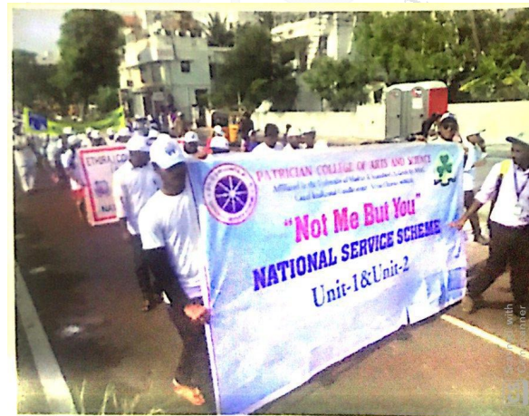
On 8 th September 2017 NSS volunteers participating in the National Eye Donation Day Chennai