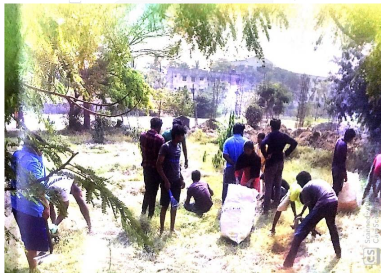
MaruvomMatruvom, Avanipur, Tindivanam on